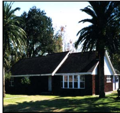
New Facility in Texas City

The Wood Group is excited to announce the opening of several new programs in Texas. TWG has recently opened two residential programs that are located in Beaumont and Sherman and additional residential programs will open in Texas City and Laredo in early summer. With the addition of the new residential programs, we will also be operating sixteen residential programs in Texas. Our company is in the early stages of developing a residential facility in Austin that should open in early fall. In addition to our expansion in residential facilities, we are also expanding our rehabilitation services. Our El