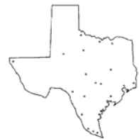
Areas Served by The Wood Group

vices in other locations where we currently operate. TWG will announce additional new programs and services in the upcoming months of 2007 and will continue to develop our presence in parts of Texas we currently do not serve. TWG continues to be committed to providing quality services to the Mental Health Community of Texas.